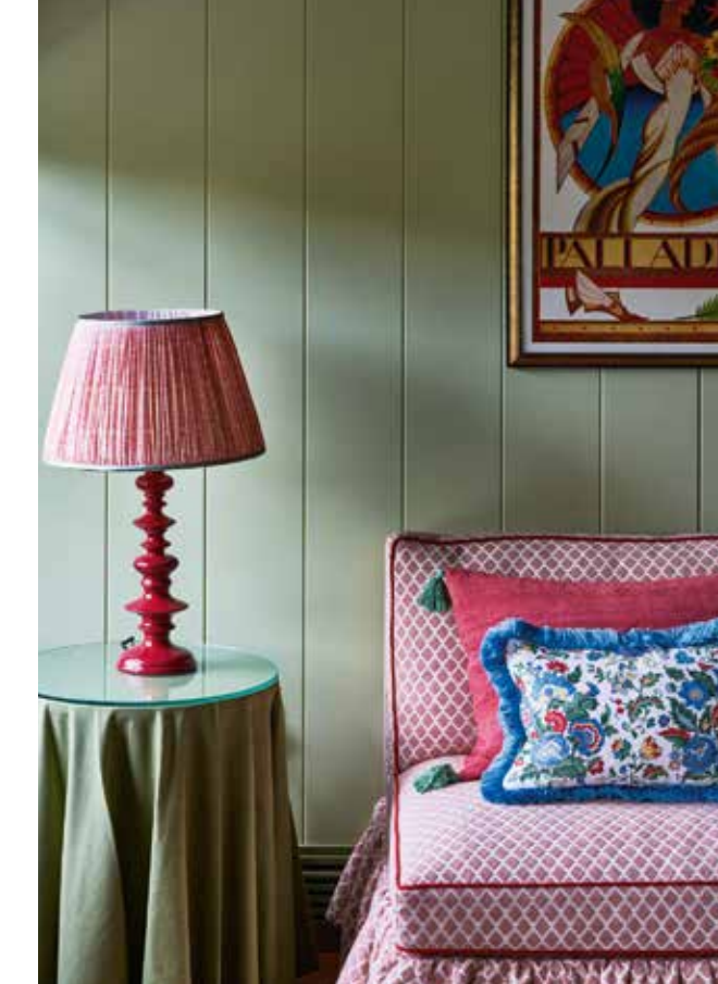
A triumph in clashing pattern and print, Beaverbrook Town House stands proudly on sought-after Sloane Street

DETAILS: Rooms at Beaverbrook Town House begin at £400 per night; visit beaverbrooktownhouse.co.uk. Book a hybrid Range Rover Sport via theout.com.